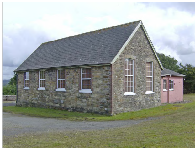
Brynberian temporary summer youth hostel was here at Llwynhirion School. In the absence of any authentic YHA photograph, these August 2015 shots of the building, now refurbished to provide a Village Hall, must suffice