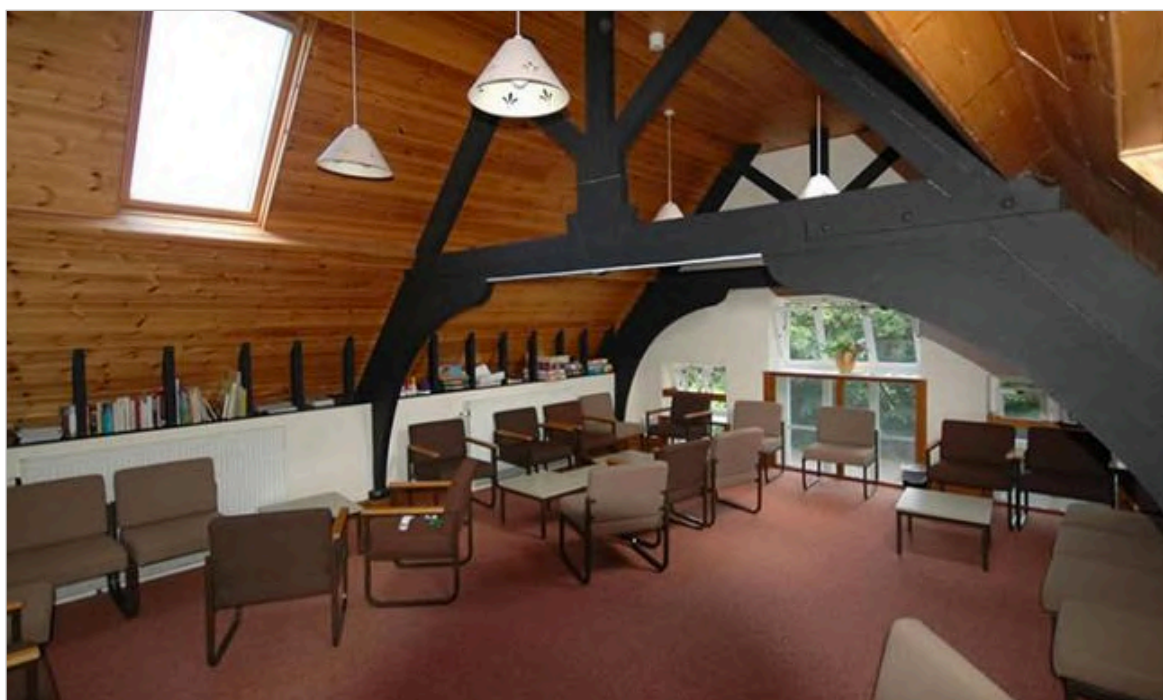
The attractive mezzanine floor lounge of Trefdraeth Hostel (YHA publicity photograph)