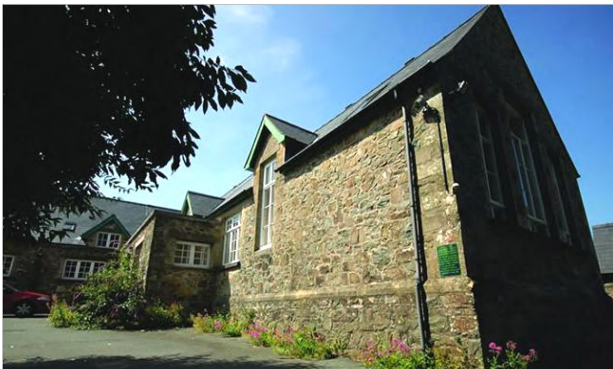
Newport (Trefdraeth), a cheerful addition to the Pembrokeshire Coast Path hostels.