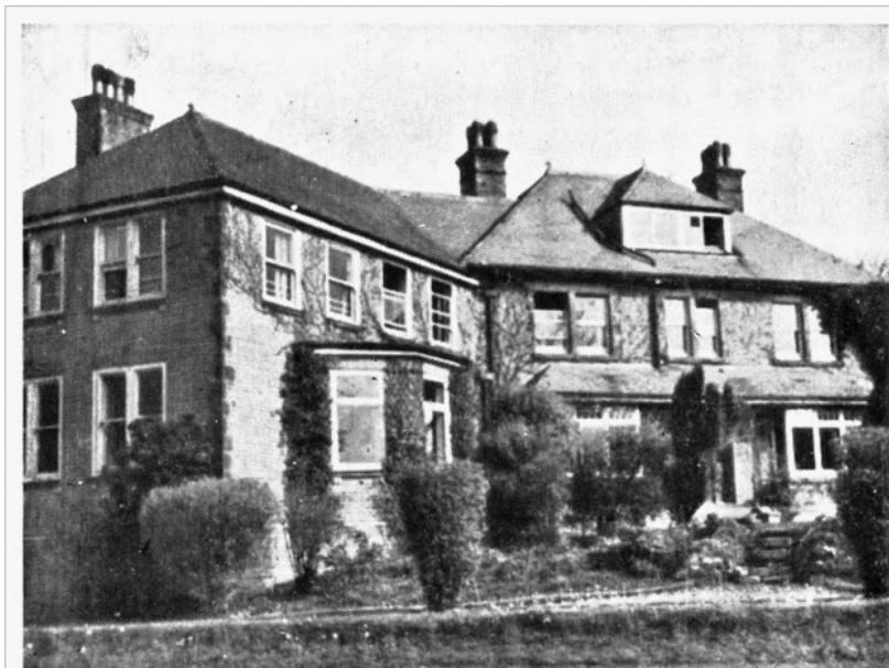
WHITE MEADOWS YOUTH HOSTEL, Derbyshire