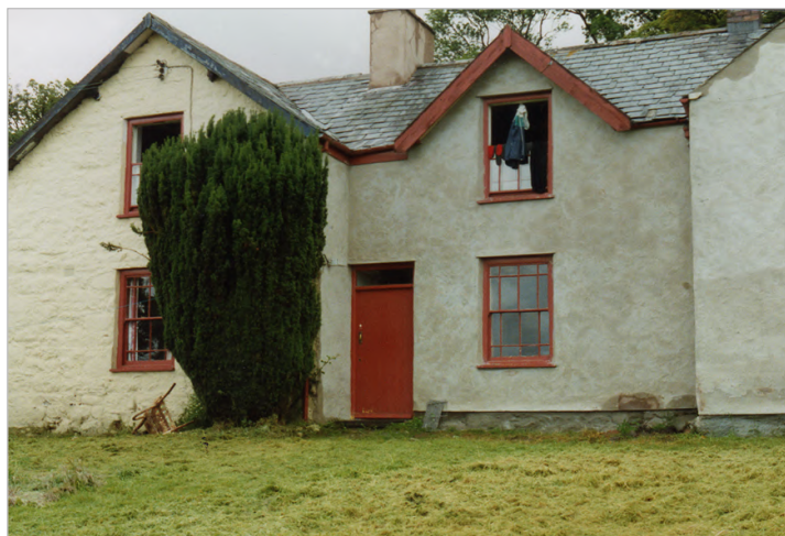
A rare colour view of Ro Wen hostel in its middle years. The simple porch had by now been demolished. Many traditional images of this hostel and others like it show YHA's preference for the natural airing of bedrooms, sometimes to the discomfort of the inmates. The open window also provided an ad hoc drying space