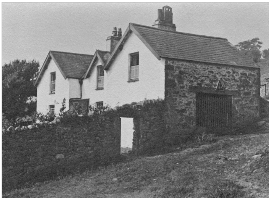
Another early image of Ro Wen hostel. Here the garden entrance has a lintel; whether this predated the previous views and had since fallen down, or postdated them after repair, lies in the realm of mystery

Two years later I returned: to the cottage three fields to the south where I stayed for seven years and climbed and wrote my first book. The YHA gave me the beautiful ship's cookstove from Rhiw which was to grace my kitchen for the rest of the time I lived on Tal y Faen. It was a good stove.