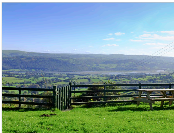
Modern images of Ro Wen hostel from the 2011 refurbishment (YHA Archive)

© John Martin, 2020. YHA Profiles are intended to be adaptable in the light of new materials gained by YHA Archive.