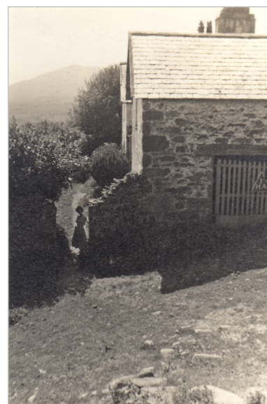
Rhiw Farm youth hostel, high above Ro Wen village, in 1952.

1: the old farmhouse was here into its sixth season as a youth hostel; 2: a jumble of buildings from the other side of the lane; 3: warden Gwen Moffat is silhouetted against the entrance