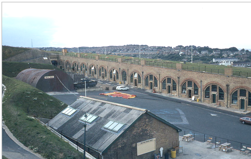
A rare view of Newhaven youth hostel

Barely two years later, Fort Newhaven hostel had to close. On 1st July 1985, according to the annual report, the region reluctantly took closure action because the owners were not operating to the standards required by the Association and the public health authority.