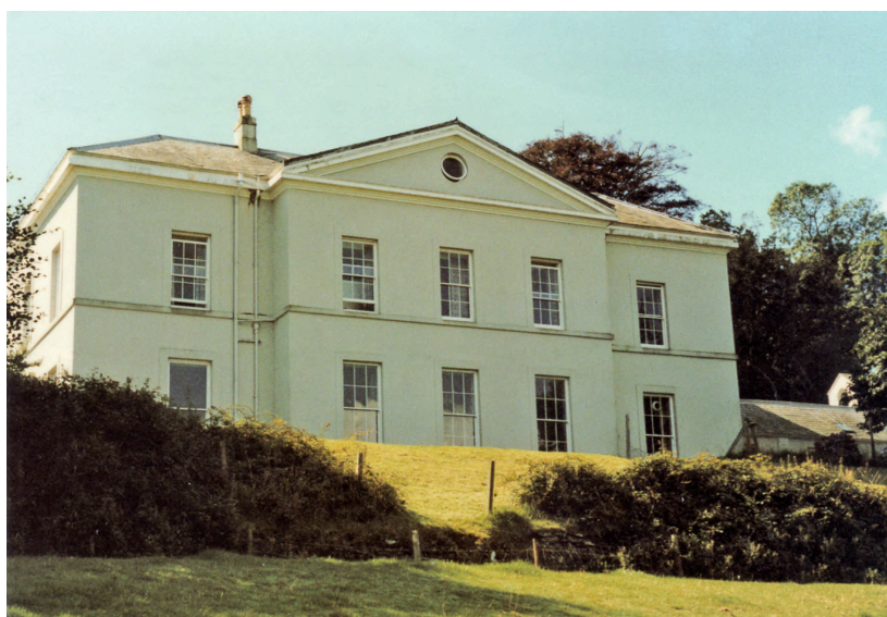
Penquite House, Golant.