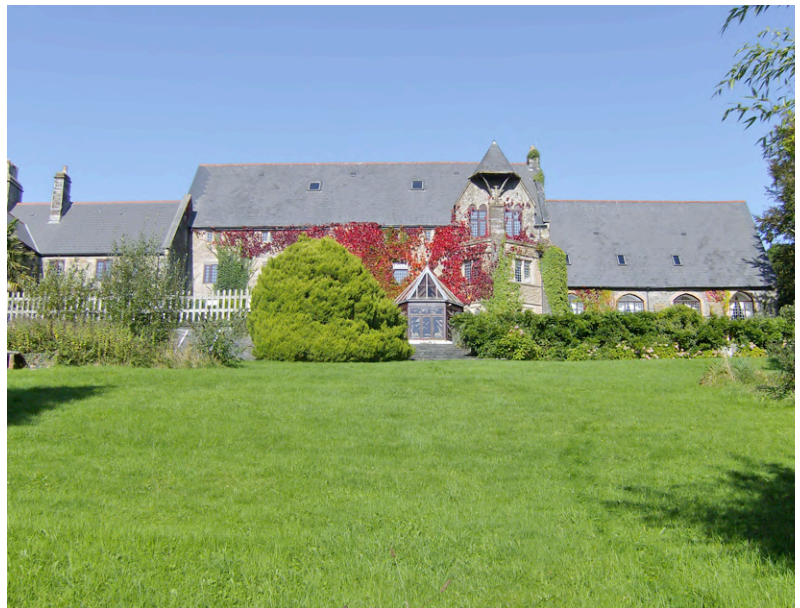
Loshwithiel youth hostel.