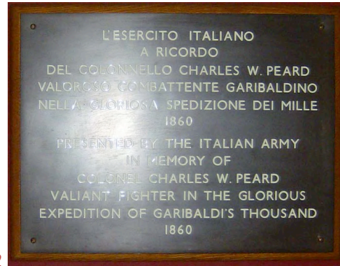
1 2 Penquite House, Golant.

1: side entrance and bell-tower. YHA used this annexe for the self-catering kitchen and utilities – photograph by G Miller (author's collection); 2: this plaque is hung in the house and bears the inscription: 'Presented by the Italian army in the memory of Colonel Charles W Peard, valiant fighter in the glorious expedition of Garibaldi's Thousand, 1860'. Garibaldi was a feted visitor to Fowey and Golant House and treated with royal homage by the local populace (author's photograph, 2013)