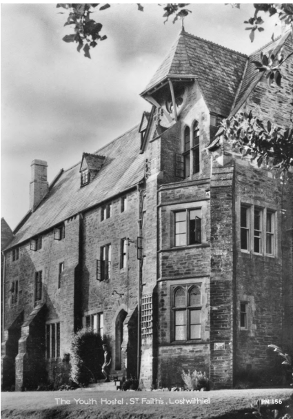
The Youth Hostel, St Faith's, Loshwithiel