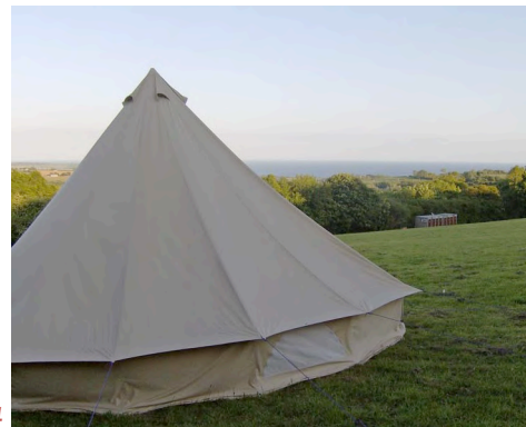
1: the YHA reception marquee –

(upper left: reception entrance. Four of the front row of Snoozebox rooms are shown behind; the three visible on the right, Rooms 102-104, are of the smallest size, and that on the left, Room 105, one of the 54 regular family rooms; lower left: general seating and café / bar area in the marquee, self catering being to the left of the enclosed reception desk; right: children's play area. The floor throughout is of recycled timber, in keeping with the Eden philosophy); 2: the interior of one of the standard family units; 3: roadside aspect. The service bus calls here; 4: one of the six bell tents pitched on the huge camping field. Views are breathtaking