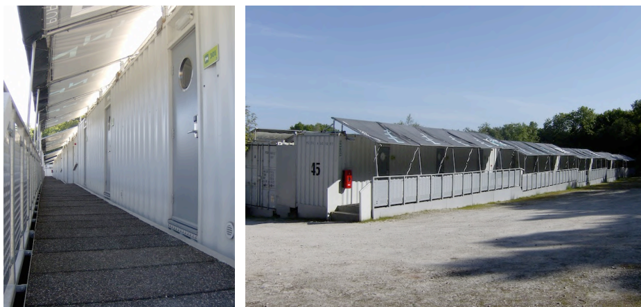
Front and rear row of the Snoozeboxes at YHA Eden Project (author's photographs, June 2015)

In June 2015 the facility was further enhanced by a new very large camping ground on higher ground adjacent to the west. This is supplied with six large fitted bell tents, and the field can accommodate up to a further 80 individuals in self-pitched tents. Toilet and shower facilities are laid on, and campers may use the central services marquee, drying room and cycle store. Public transport from St Austell serves the YHA and Eden Project and is an important feature.