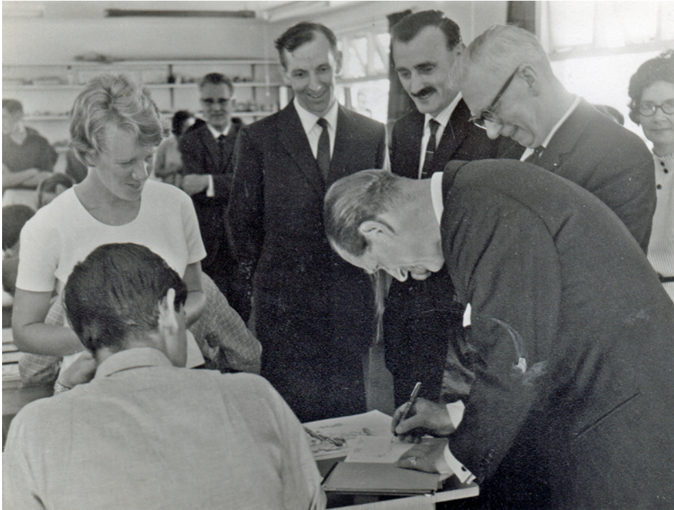
The interior of the new Field Studies building at Hawkshead hostel at its official opening in 1966, when it was opened by the Duke of Edinburgh. Guests, officials and probably a few innocent hostellers attend. Today a plaque at Hawkshead still marks the occasion. Field Studies have subsequently expanded to another site, and the original building has been adopted as the manager's home. YHA Archive catalogue number Y050001-Hawkshead 17