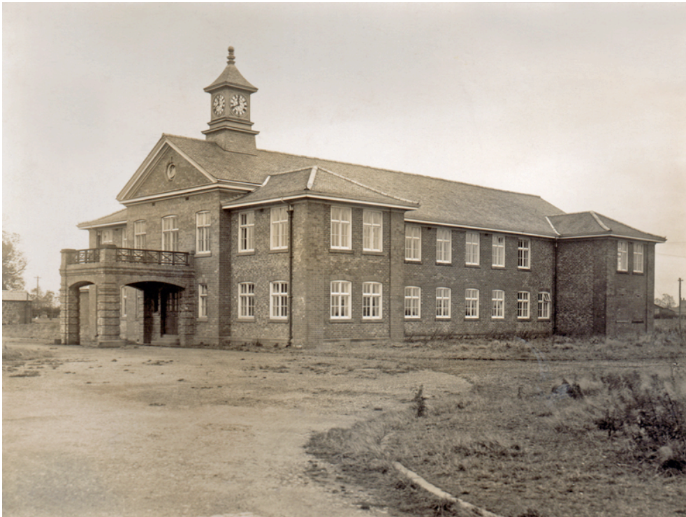
In the early 1930s YHA cast around for any vaguely suitable building to open at almost a moment's notice, and there were plenty going spare. One unlikely acquisition was Gretna hostel, not in the Scottish village but just over the border into YHA's Lakeland territory. The building had been the offices and focal centre of the huge first world war armaments depot at Mossband, north of Carlisle (and just to the east of the M6), but redundant and acquired as a youth hostel in 1932. It ran till 1936, when replaced by a hostel in Carlisle. Langdale has provided YHA with its first photograph of this hostel. YHA Archive catalogue number Y050001-Gretna 01