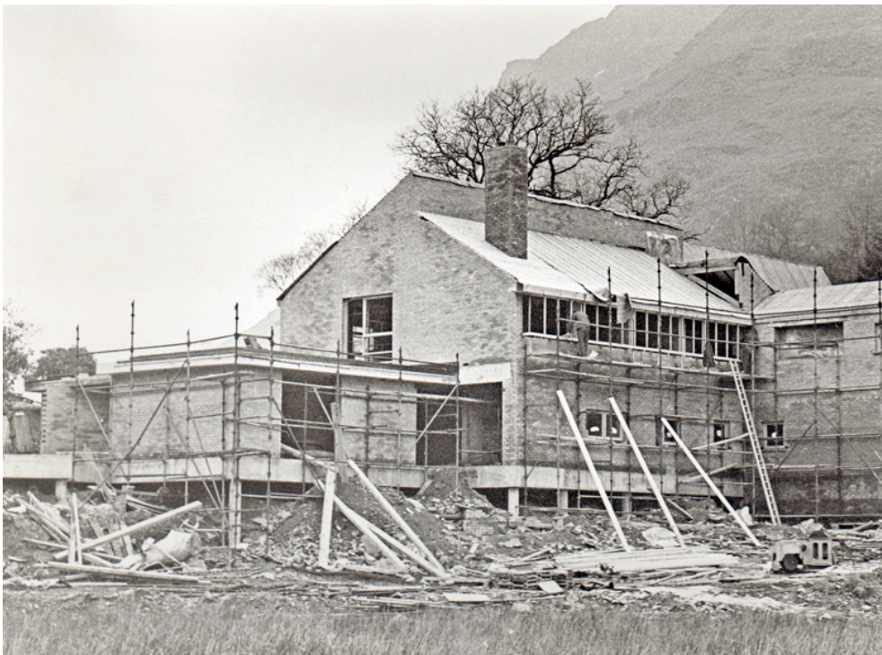
Patterdale's new youth hostel was here under construction early in 1971; the premises opened later that year. The Langdale collection has provided the Archive with its first view of the building in its unfinished state; the construction on stilts is clearly seen. The YHA Archive catalogue number Y050001-Patterdale B 13